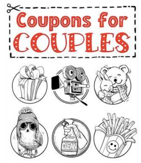
24 Sweet & Thoughtful Little Gifts for the One You Love

CLIP AND REDEEM THESE COUPONS WITH YOUR SWEETHEART!